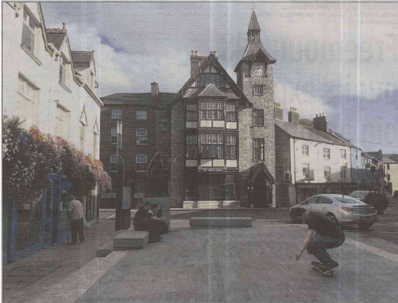
Above: A panoramic view of Thomas Davis Square with the landmark Clockhouse building, which is currently in the process of being refurbished, in the background.