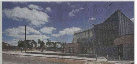
The €4.1m Hollyhill Library which opened last July as a key element of a major regeneration programme in the Cork suburb.