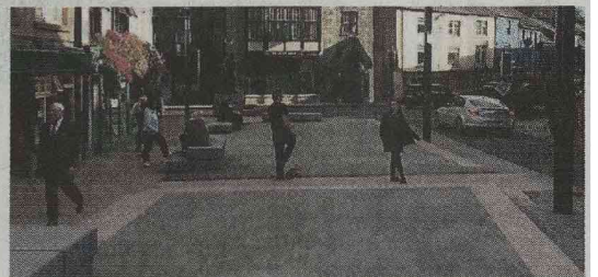
Thomas Davis Square in Mallow, which forms the centrepiece of the pedestrianised plaza in the heart of the town centre.